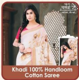
Khadi 100% Handloom Cotton Saree